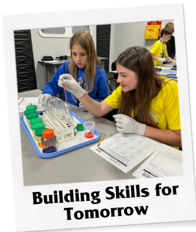
Building Skills for Tomorrow

The FHSD Portrait of a Learner provides a framework for instruction and ensures all schools are aligned in encouraging students to demonstrate key skill sets by being critical thinkers, empathetic communicators, creative problem solvers, engaged collaborators and adaptable learners.