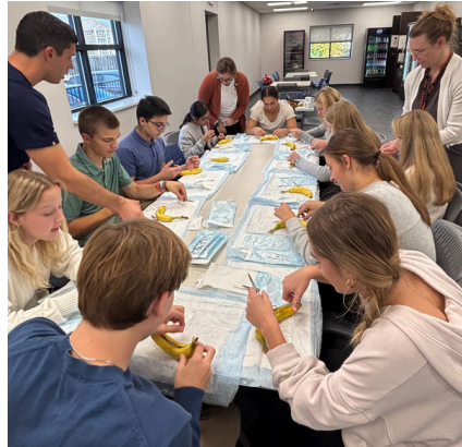
Students in the OrthoCincy Healthcare Career Exploration Program learn about stitching wounds by practicing on bananas.