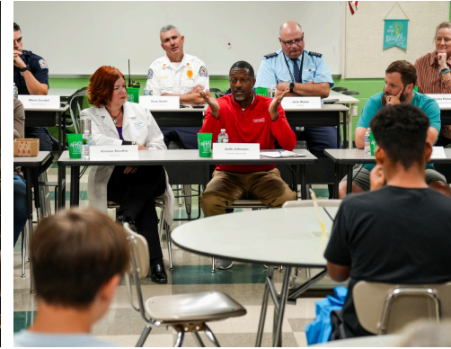
Students participate in a career exploration panel with local professionals from a wide variety of industries.