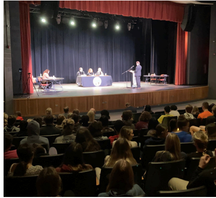
Government students observe a session of the Hamilton County Court of Appeals at Anderson High School.

An array of other opportunities engage students with unique interests, including a robust leadership program for select sophomores supported by The Forest Hills Foundation for Education and The Bob and Jeanne Coughlin Foundation. Classroom-based activities are also expanding to expose even more students to valuable future-focused learning opportunities.