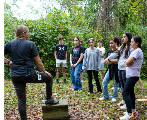
Sophomores in the Aspire Youth Discovery Initiative prepare for a team-building exercise at NewPath Child & Family Solutions.